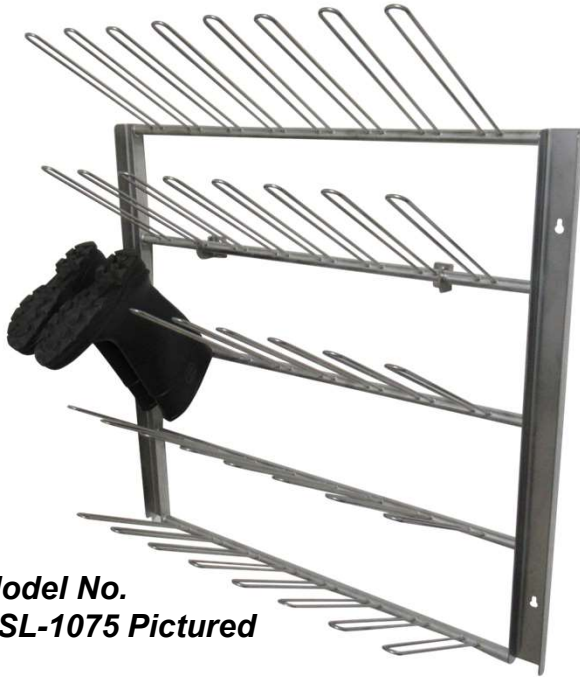
Model No. SSL-1075 Pictured