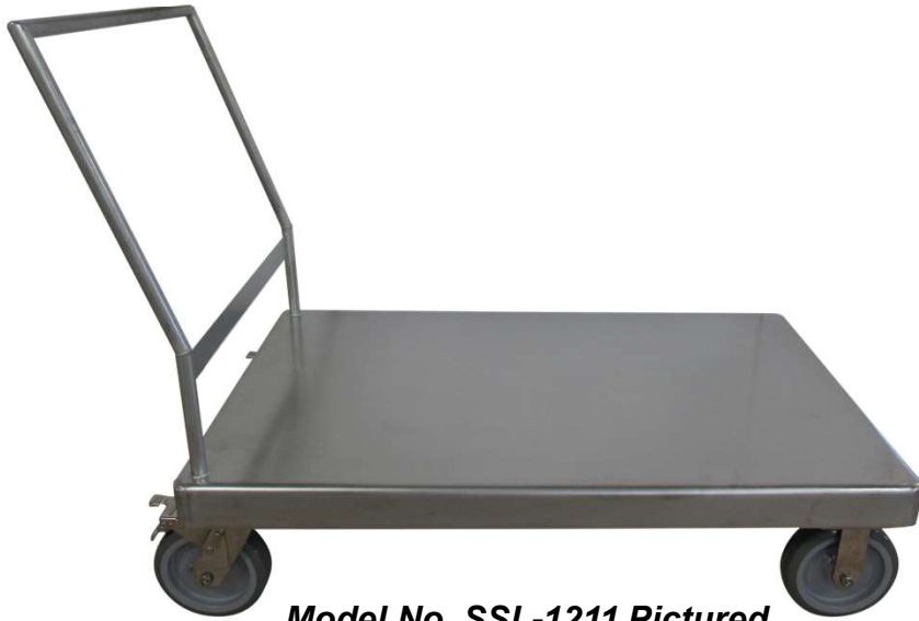
Model No. SSL-1211 Pictured